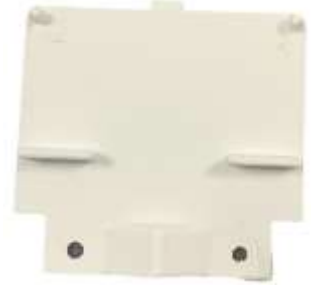
Polypropylene Lower Cover