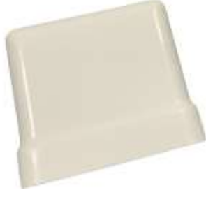
Cable Locking Place