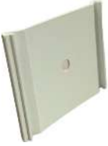
PVC Montage Clips