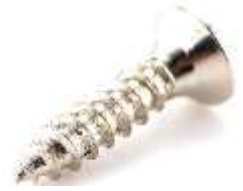
2,8 -10mm Cover Montage Screw

* TUNÇ PLAST, gerekli gördüğü uygun değişiklikleri önceden bildirmeden yapma hakkına haizdir.