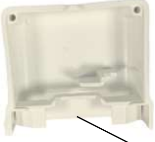
Polypropylene Top Cover